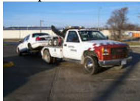
2904 fail: The Interceptor gets towed in Nebraska.