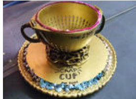
To the victors go the "spoils" — the Crap Cup.